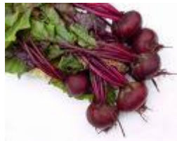
Beet / Beetroot