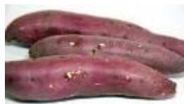
Sweet potato / Yam