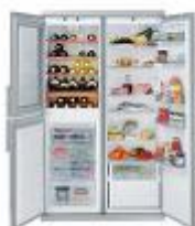
Fridge / Freezer / Refrigerator