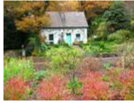
A tree house