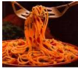
Spaghetti / Noodles