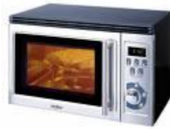
Stove / Cooker