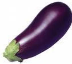
Eggplant / Aubergine