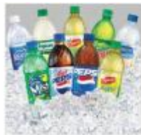
Lemonade / Soft drink