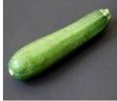
Zucchini / Courgette